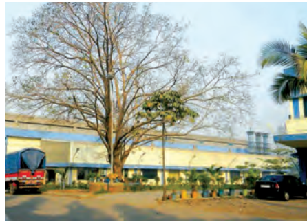
Balmer Lawrie - Van Leer Ltd.