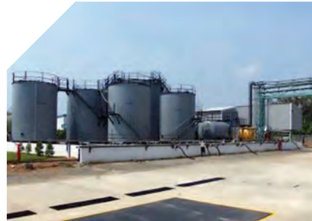
PT Balmer Lawrie Indonesia