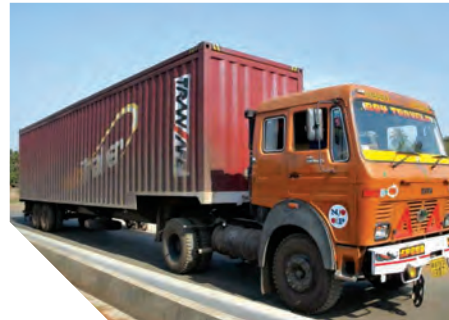
Transafe Services Ltd.