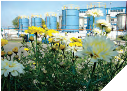
AVI-Oil India (P) Ltd.