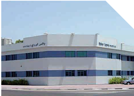
Balmer Lawrie (UAE) L.L.C.